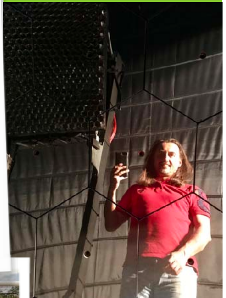
The 3 rd last time...