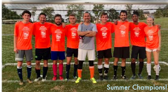
La banda de Liniers!