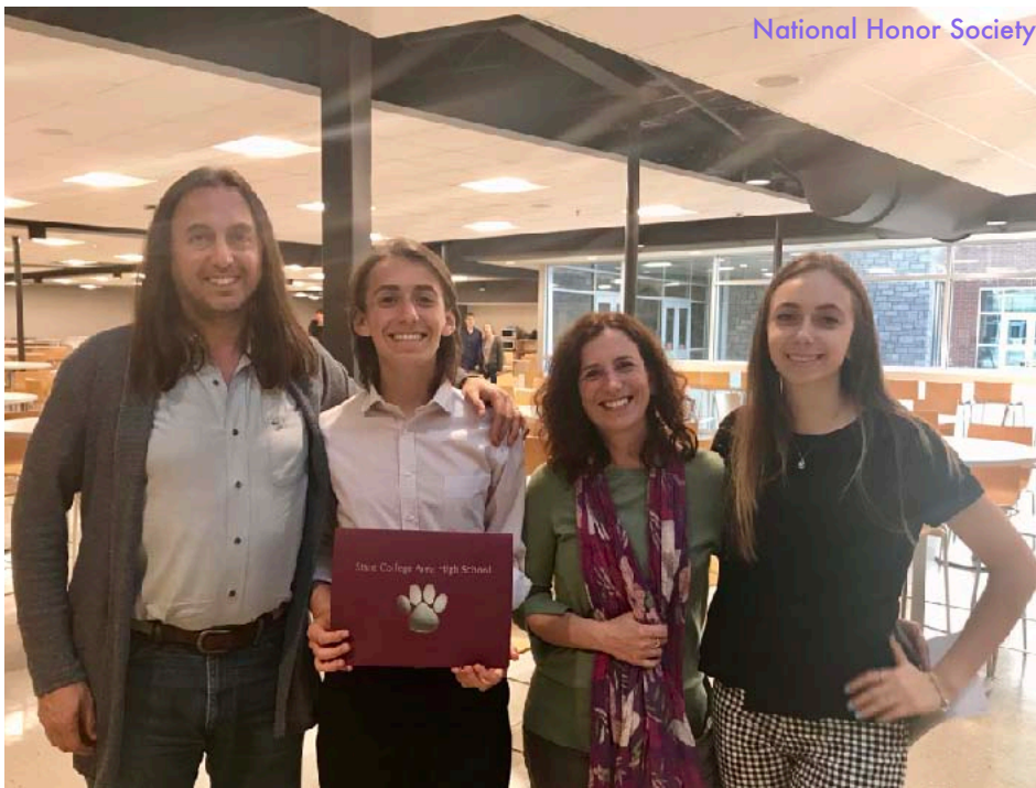
National Honor Society