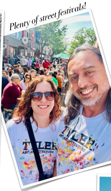
Plenty of street festivals!