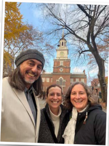
We'll celebrate the 250 th birthday of the U.S. in its first capital!