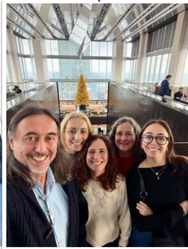
Cool views & places to eat!