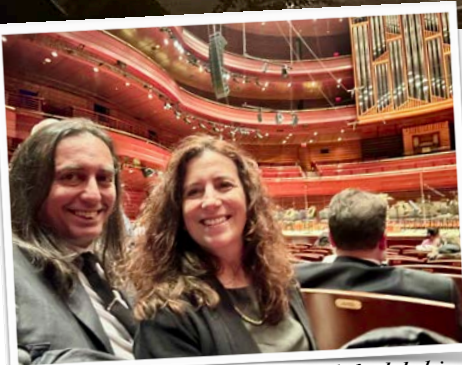
Plenty of theaters and the Philadelphia Orchestra at the Kimmel Center!

According to the Wall Street Journal, Philly is the World's best place to visit in 2026 . Come and decide for yourself. We're waiting for you! You never know for how much longer we'll stay here... ;oP