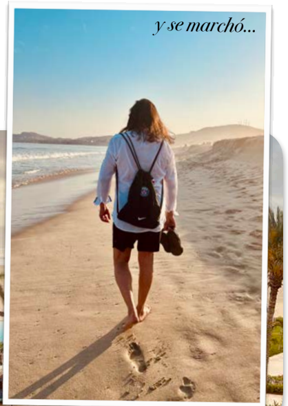
y se marchó...